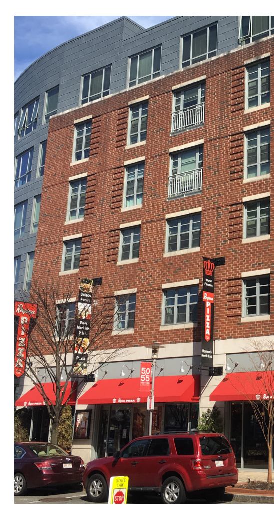
Station Landing Medford, Massachusetts

Mixed use. The most widespread trend in land use planning and rezoning in Greater Boston over the last two decades has been towards mixed use, where commercial and residential uses are combined, typically in the same building, but sometimes on the same parcel. Most housing production plans and master plans adopted in the last decade (59 of 75) address mixed use zoning. Eighty-three of the 100 municipalities surveyed have explicit provisions in zoning for mixed use development. The mixed use provisions are typically for city/town/village centers, commercial corridors, and the redevelopment of industrial properties – and especially by transit nodes. There is no movement to allow commercial uses in existing residential neighborhoods.